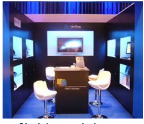
Shelving and alcoves